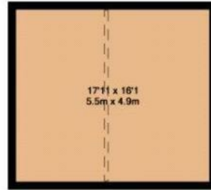
PARKING AREA AND BIN STORE

TOTAL APPROX. FLOOR AREA 675 SQ.FT. (62.7 SQ.M.) Whilst every attempt has been made to ensure the accuracy of the floor plan contained here, measurements of doors, windows, rooms and any other items are approximate and no responsibility is taken for any error, omission, or mis-statement. This plan is for illustrative purposes only and should be used as such by any prospective purchaser. The services, systems and appliances shown have not been tested and no guarantee as to their operability or efficiency can be given. Made with Metreps G2015